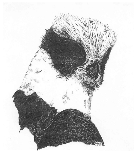
Laughing Falcon