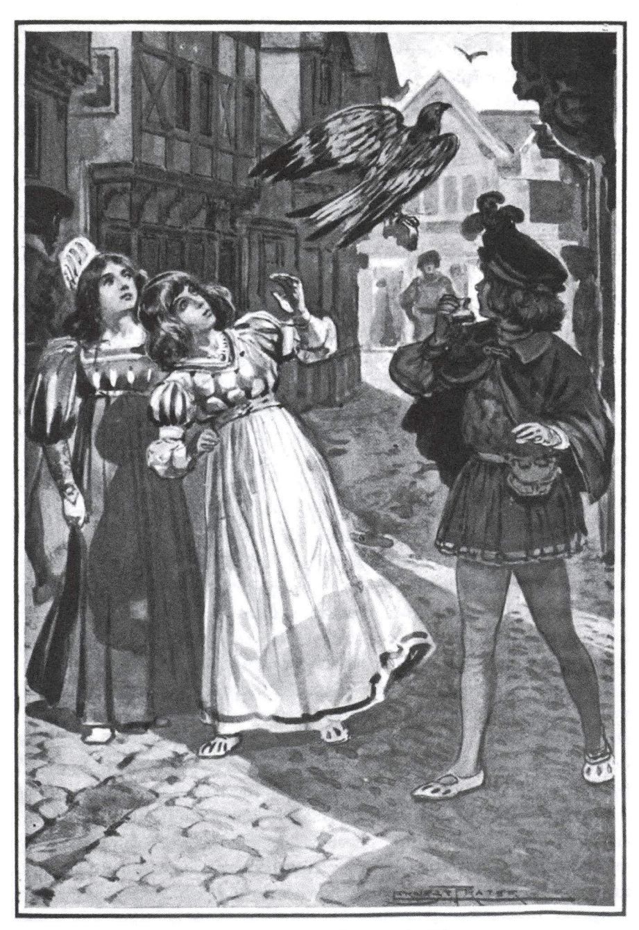
Figure 1.1. Red kites in 16th-century London, from Lea (1909).