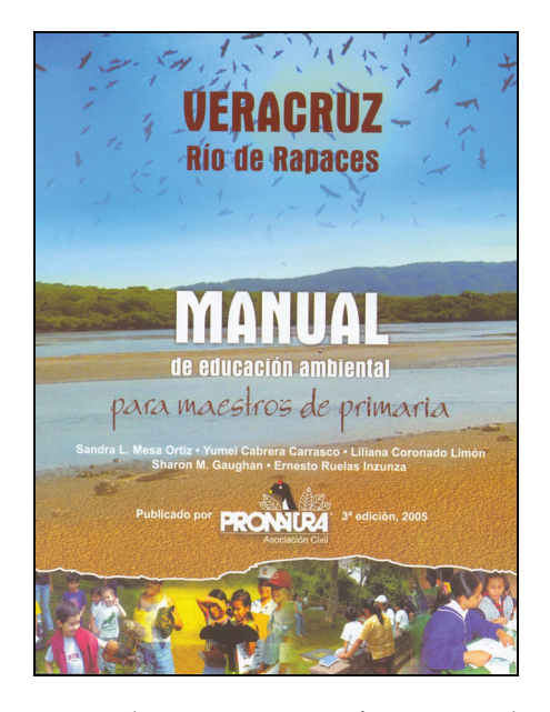
FIGURE 2. The Veracruz River of Raptors teachers' manual. The formal environmental education programs take place in elementary schools in Cardel and Chichicaxtle, Veracruz, every autumn. VRR educators have given similar programs in many other localities across central Veracruz and trained dozens of teachers to use the manual with their fourth grade students.

project. Consider these facts: a) a field assistant collecting migration count data requires at least two field seasons of work and a training internship before becoming a fully trained field biologist capable of running the field protocol at the current standards of data quality, b) educators take at least one season as a trainee before being able to conduct programs in schools, and c) VRR has had over 150 people in its field operations over the years.